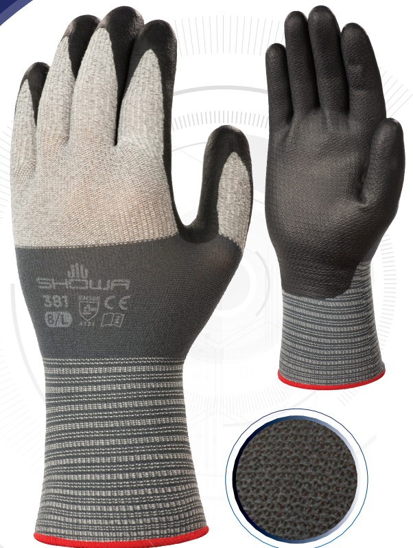
Embossed Microporous Nitrile Palm Finish

Moisture inside the glove flows into narrow spaces without the assistance of, and in opposition to external forces like gravity and evacuation. This is naturally triggered by heat emitted by the hand, causing natural vaporisation.