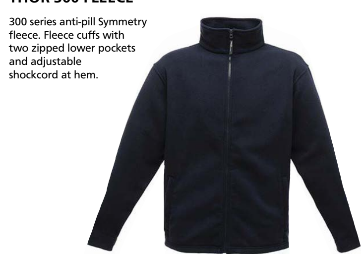
Sizes: 10 - 20