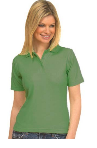
Sizes: 10 - 18

50% polyester / 50% cotton. Knitted collar, with three selfcoloured button placket. Twin needle stitching, taped shoulder and back neck.