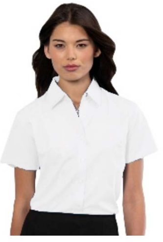
Sizes: 8 - 26

70% Cotton/ 30% polyester oxford. 135g/m2 (colours), 130g/m2 (black and white). Two button collar stand with classic shaped collar. Darts at bust-line and back for tailored fit. Rounded two button adjustable cuffs. Rounded hem. Suitable for 40° wash and tumble dry.