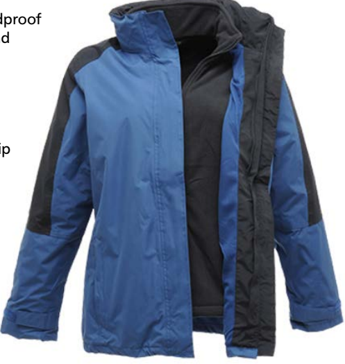
Sizes: 10 - 20

Waterproof and windproof with taped seams, and anti-pill fleece inner. Concealed hood with adjuster, adjustable shockcord hem. Two zipped lower pockets. Concealed zip entrance in lining for embroidery access.