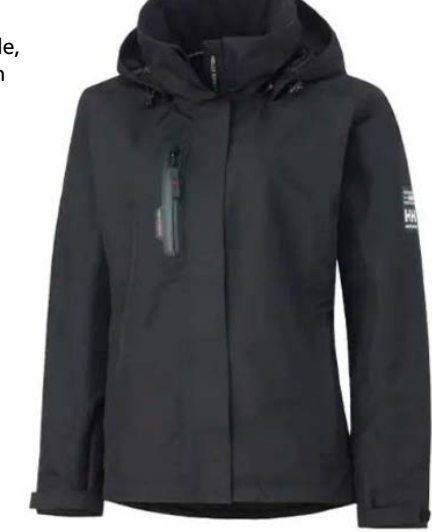
Sizes: 10 - 18

Helly Tech waterproof/ breathable fabric. Packable, removable hood with chin guard. Chest pocket with water repellent zipper wand external tape. Two zippered hand pockets and inner chest pocket. Drawcord at hem, with extended back.