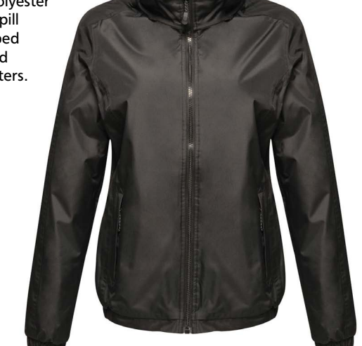
Sizes: 10 - 20

Waterproof and windproof Hydrafort 500 Polyester fabric, with anti-pill fleece lining. Taped seams. Concealed hood with adjusters.