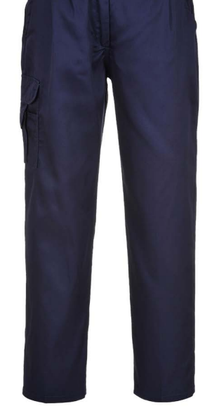
Sizes: 8 - 20

Comfortable and stylish, with a back elasticated waist for extra freedom of movement, this garment features two side pockets and a combination thigh and mobile phone pocket.