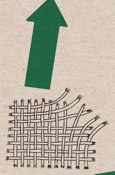
Knitted or woven into fabric