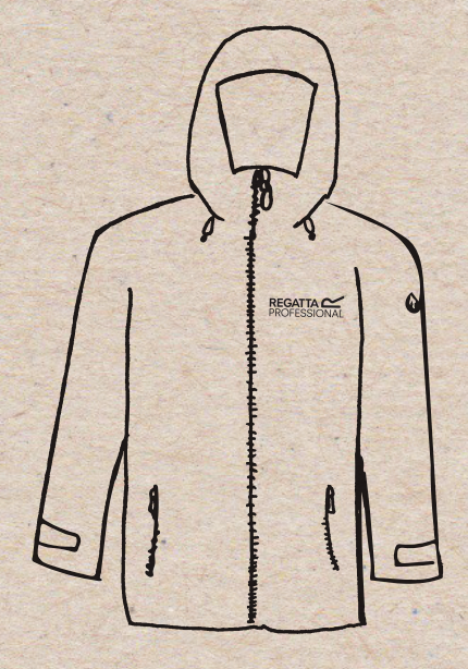
Made into garments